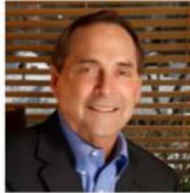
Jim Petro Former Ohio Attorney General and advocate for criminal justice reform